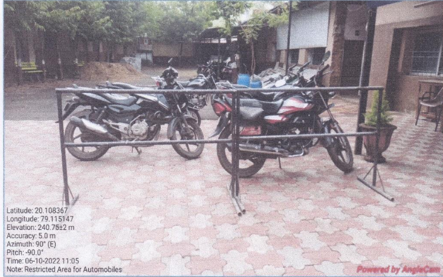
Restricted Entry of Automobiles in Campus